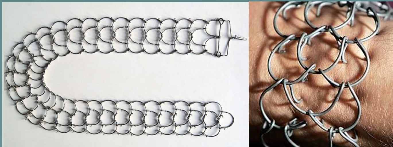
Figure 2: The cilice from Priest's Point is similar to those that are still on the market today (left from www.cilice.co.uk ). When worn around the thigh, the wire loop ends are directed down onto the skin, where they cause discomfort (right).

The cilice from Priest's Point is a series of connected U-shaped iron wires, forming a net measuring at least 15 cm long and 6 cm wide. Each wire terminates in a loop and exposed tine. A hook is attached to the end, suggesting that the cilice was originally longer and may have been worn around the thigh (Figure 2). It bears many similarities to a cilice excavated from an 18th c. context at Fort St. Joseph, a French mission and garrison in Michigan (Brandão and Nassaney 2008).